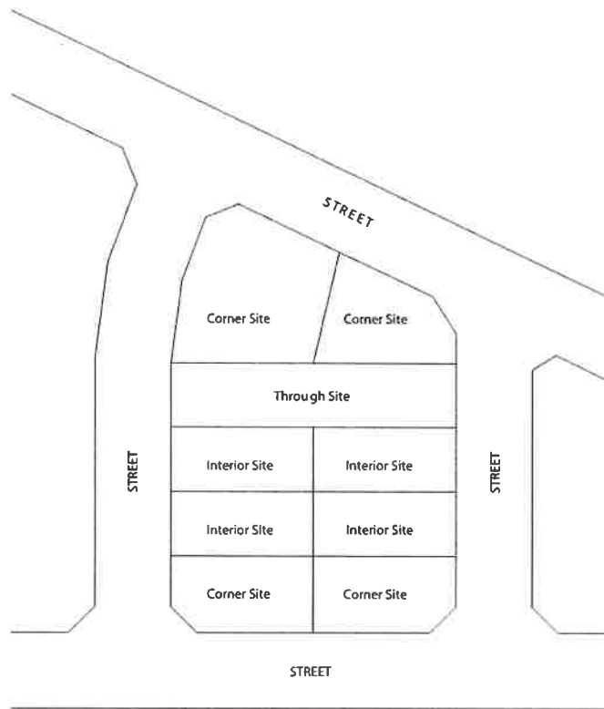
Figure 2-3: Illustration of Site Definition

Site Coverage: that portion of the site that is covered by principal and accessory buildings.